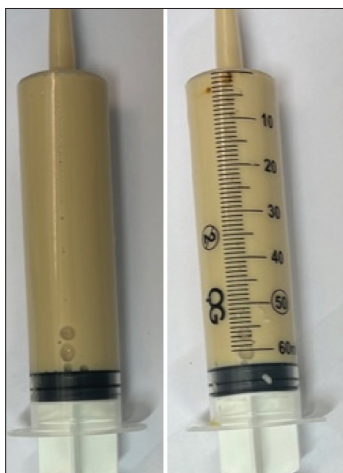
Figure 1: milky ascitic fluid aspirated from the patient

Chylous ascites has rarely been reported as a consequence of severe right heart failure [10]. The proposed underlying mechanism describes the pathologic events as follows: High venous pressure increases abdominal lymph production secondary to increased