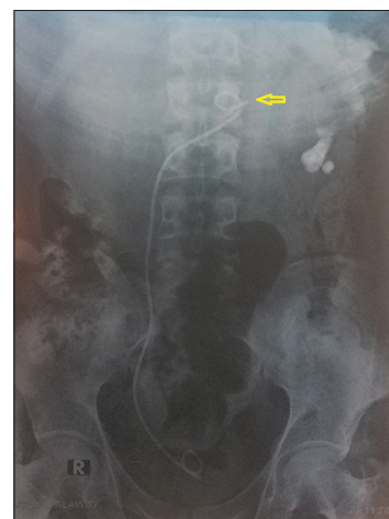
Figure 1: The proximal tip of double J stent within the peritoneal cavity (arrow)

Complications associated with ureteral DJ stents can be divided into two groups, namely, short-term and long-term complications. The latter group is related to stent retention over long periods of time and may result in encrustations, stone formation, fractures, blockades of stents, hydronephrosis, and in severe cases, loss of